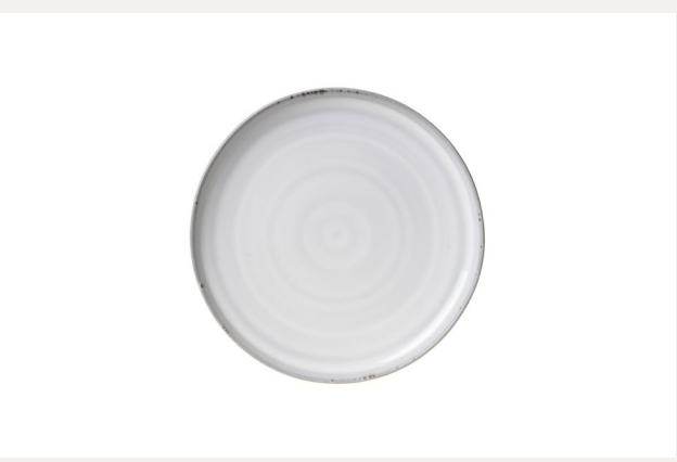
Plate 20.5 pack of 6 20.5 x 2.5 cm 8 x 0.9 in