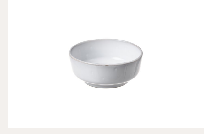
Bowl 12 pack of 6 12 x 5 cm 4.72 x 1.96 in