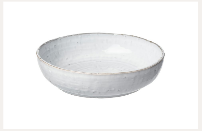
Deep Plate 22.5 pack of 4 22.5 x 5.5 cm 8.8 x 2.1 in