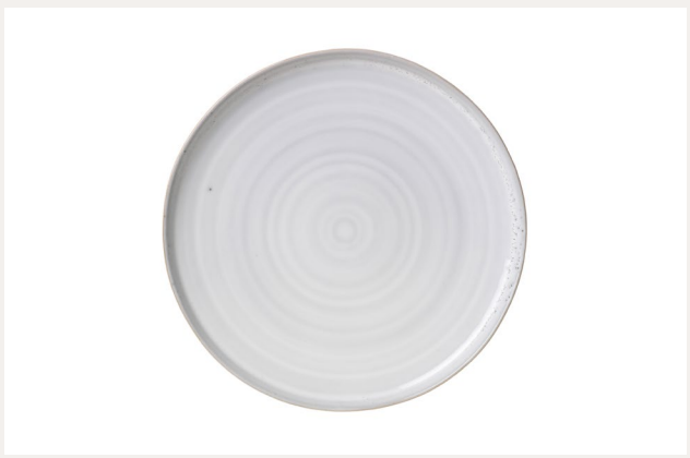
Plate 25 pack of 6 25 x 2.5 cm 9.8 x 0.9 in