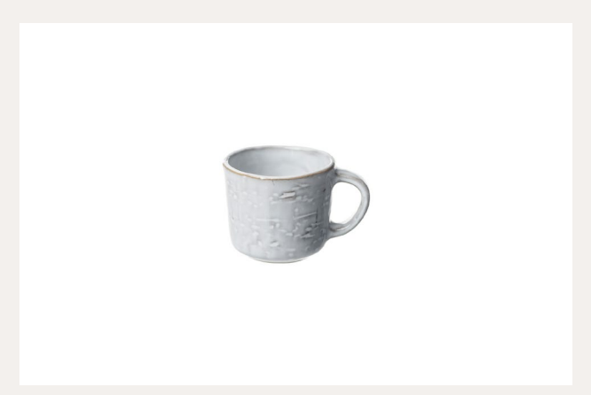
Coffee Cup pack of 4 9 x 7 x 6 cm 3.5 x 2.7 x 2.3 in