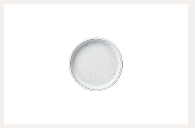
Plate 15.5 pack of 4 15.5 x 2.5 cm 6.1 x 0.9 in