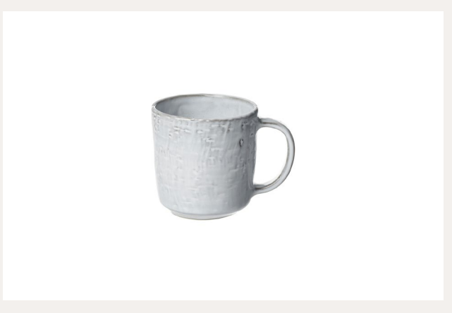
Stone 10703 Limestone 10802 White Marble 11762