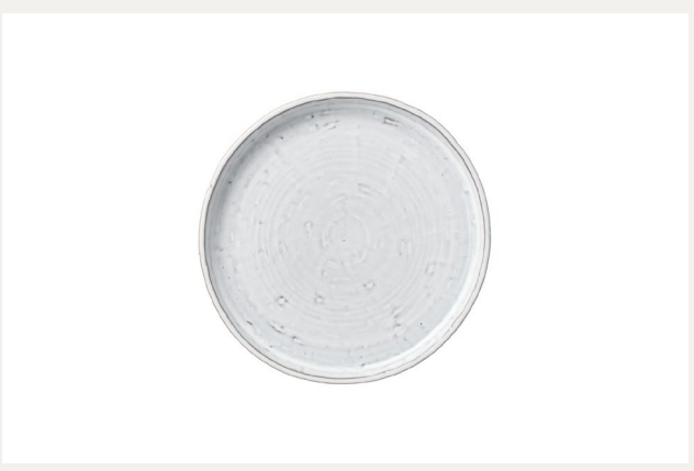
Plate 22.5 pack of 4 22.5 x 2.5 cm 8.8 x 0.9 in