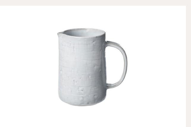
Jug pack of 1 16 x 10.5 x 17 cm 6.2 x 4.1 x 6.6 in