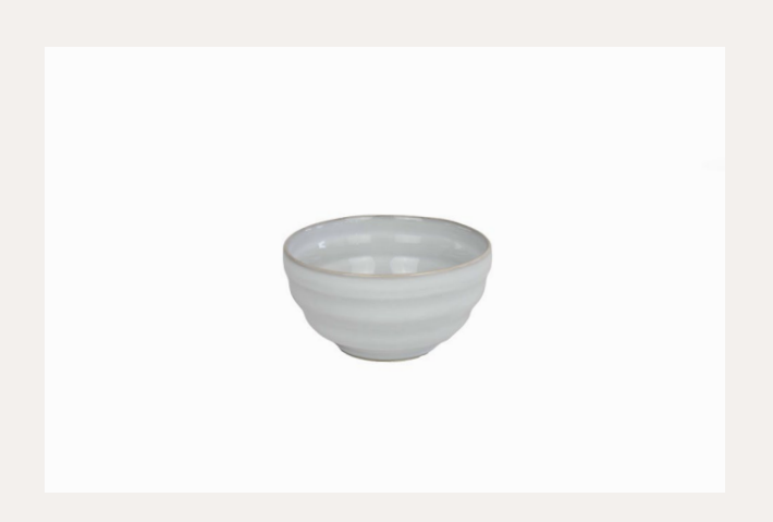
Bowl 14 pack of 6 14 x 7 cm 5.5 x 2.7 in