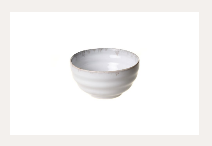
Stone 11373 Limestone 11397 White Marble 11854