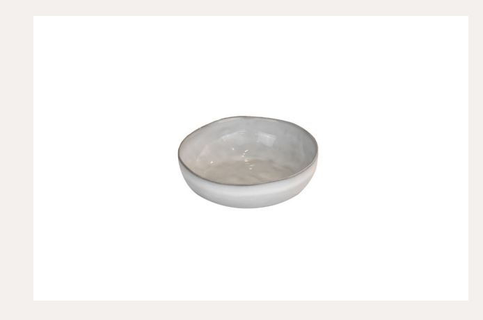
Bowl 15 pack of 6 18.5 x 2.5 cm 7.2 x 0.9 in