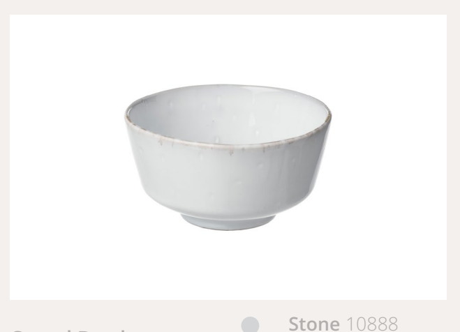
Cereal Bowl pack of 4 15 x 8.5 cm 5.9 x 3.3 in