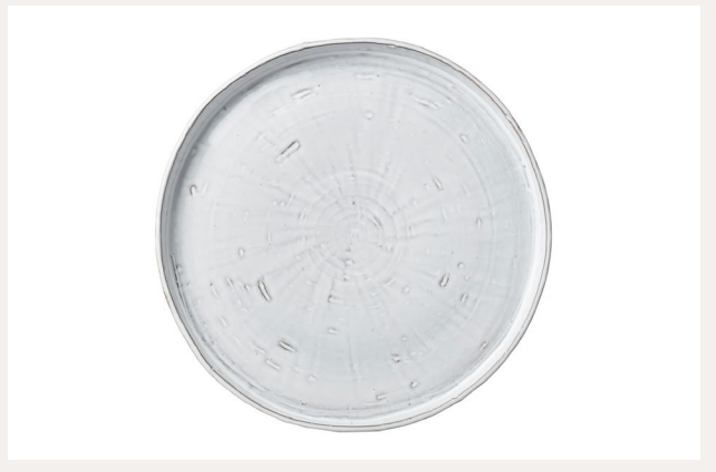
Plate 27.5 pack of 4 27.5 x 3 cm 10.8 x 1.1 in