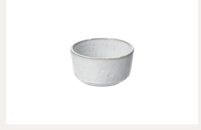
Bowl 10 pack of 4 10 x 5.5 cm 3.9 x 2.1 in