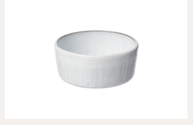
Bowl 15 pack of 4 15 x 6.5 cm 5.9 x 2.5 in