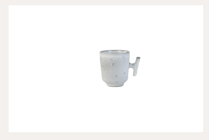
Stone 13339 Limestone 13322