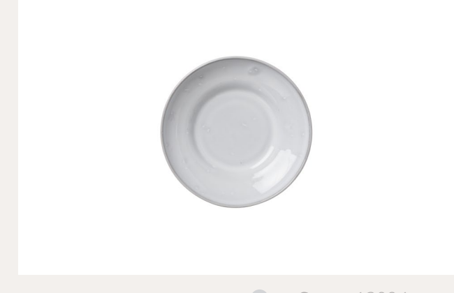
Plate 17 pack of 6 17 x 3.7 cm 6.69 x 1.45 in