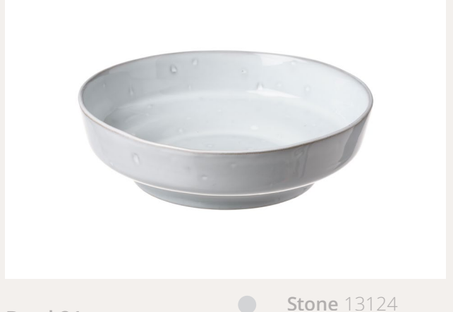
Bowl 21 pack of 6 21.5 x 6 cm 8.46 x 2.36 in