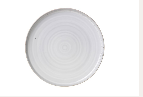
Stone 10895 Limestone 10925 White Marble 11830