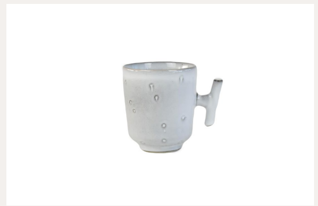
Mug pack of 6 13.5 x 9.7 x 11 cm 5.3 x 3.8 x 4.33 in